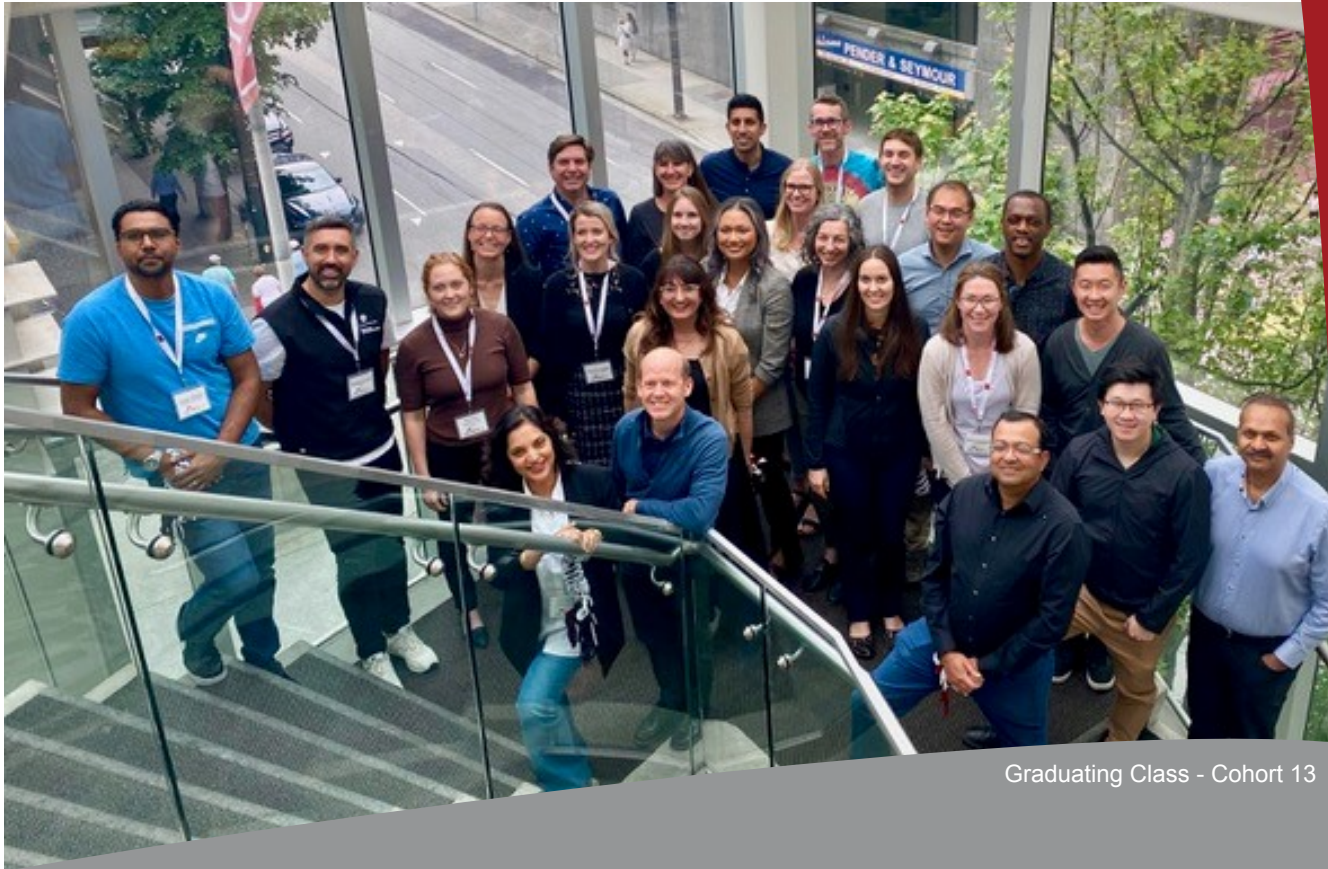
Graduating Class - Cohort 13